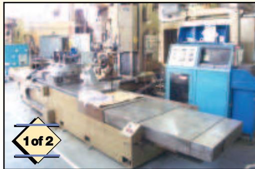
Cincinnati-Milacron 10HC-2500A Horizontal Machining Center

10" x 20" Landis IR Cylindrical Grinder , universal, plunge, with motorized work head, s/n: 825-49 6" x 14" TOS BU-16 Cylindrical Grinder , universal, with 1000 RPM motorized work head, coolant, s/n: 180949 (1982)