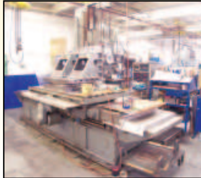
4" DeVlieg-Herbert 43H-72 "Spiramatic" Jigmil