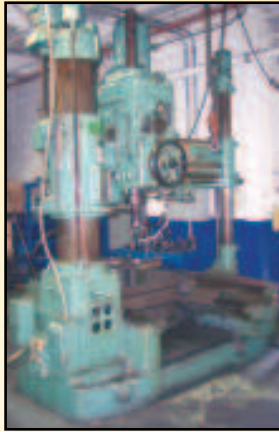
5' x 13" Oerlikon Radial Drill