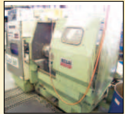
Ikegai FX25N Turning Center