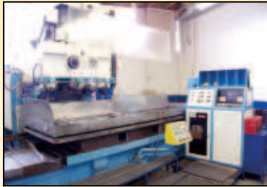
Cincinnati 3-Spindle CNC Hydrotel