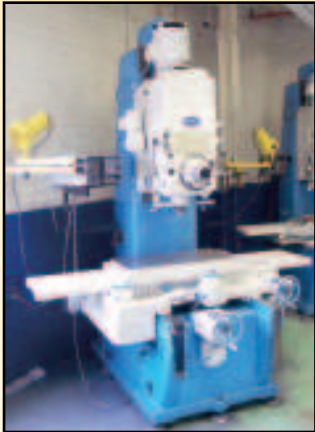
Sigma VLP600 Jig Borer