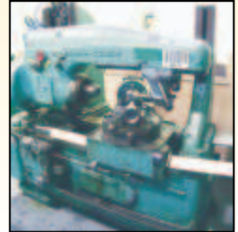
Barber Colman Type D Gear Hobber