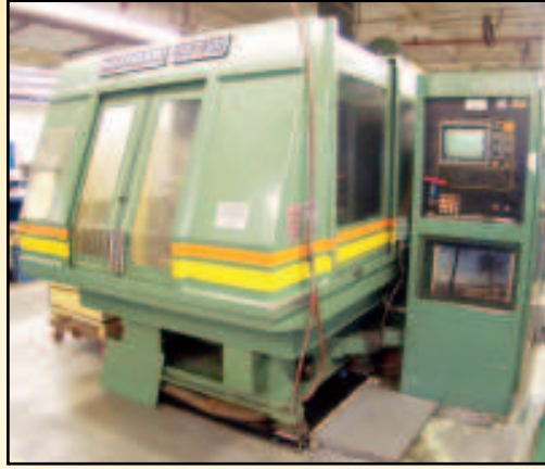
Huffman HS-75R 7-Axis Tool & Cutter Grinder