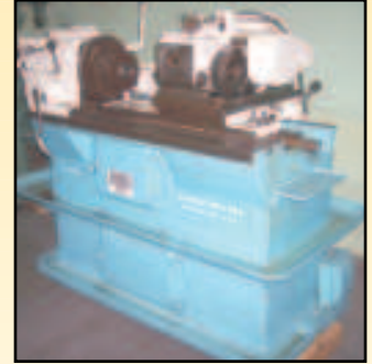
8" x 16" Hanson-Whitney Thread Mill