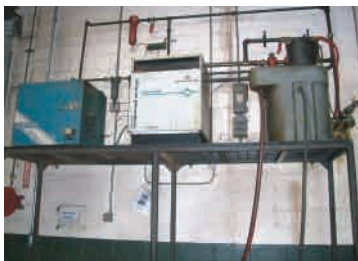
Arrow & DH Pneumatic Dryers, DH Oil-Water Separator