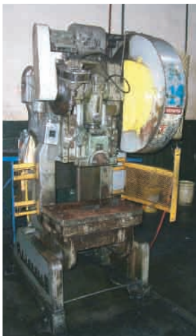
40 Ton Rousselle OBI Press

Sharp AR-200 Copier, Ricoh/Aficio 1035P Copier, Forms Pro 4503 Printer, 2 Shredders, Zebra 4000 Label Machine, Ibico Laminator, Screen Projector, HP Spanjet 42C Flatbed Scanner, Magnavox Television, 10' Conference Table, Office Desks, File Cabinets, Office Chairs, Bookcases, Dell Poweredge 1600SC Server, Dell Optiplex GX270 Minitower, Dell Latitude D600 Laptop, Dell Latitude D505 Laptop, (9) Dell Computers with Monitor & Keyboard, (2) Micron CPU's, (2) Micron Monitors, HP 1100 Inkjet Printer