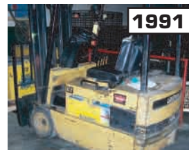
4,000 Lb Caterpillar Electric Lift Truck