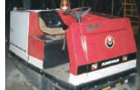
Advance Floor Sweeper