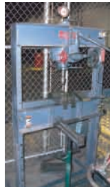
25 Ton Dake H-Frame Press