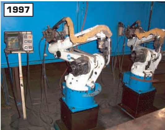
Miller Dual Robotic Cell