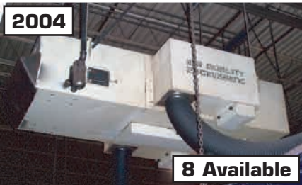
Air Quality Eng Air Cleaning Units (8 Available)