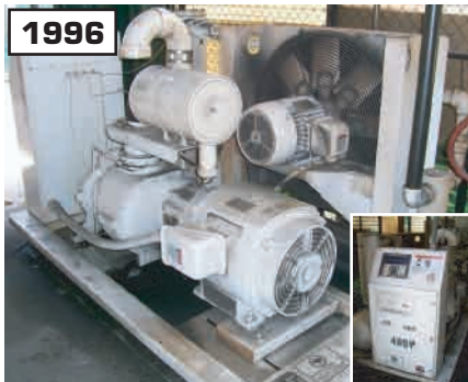
75 HP Gardner Denver Air Compressor