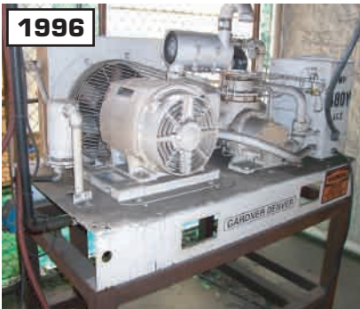
25 HP Gardner Denver Air Compressor - 4,743 Hours