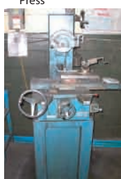
Sanford Surface Grinder