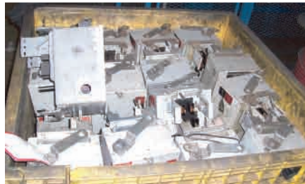
GE Spectra Series Busway Plugs