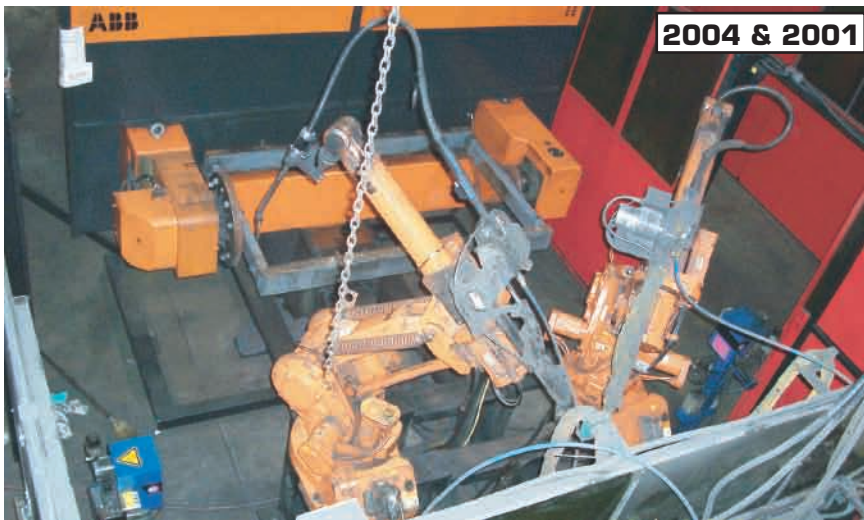
ABB Dual Robotic Welding Cell