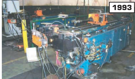
Eagle - Eaton Leonard CNC Tube Bender