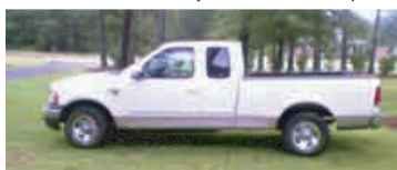
Ford Crew Cab Truck - Automatic XLT