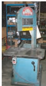
Roll-In Vertical Band Saw