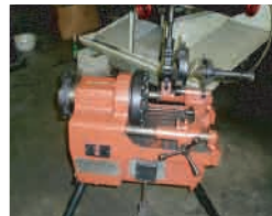
Northern Pipe Threading Machine