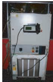
ABB Robotic Control