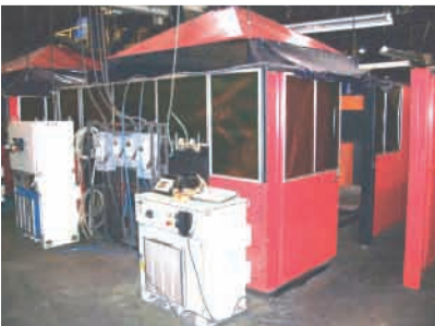
Welding Cell Enclosure with Exhaust Hood