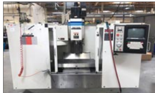
Fadal VMC3016 Vertical Machining Center