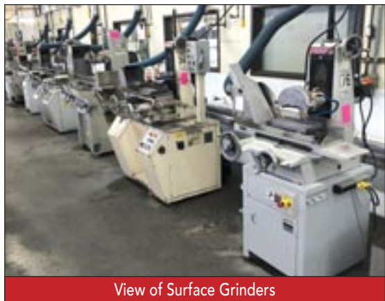
View of Surface Grinders