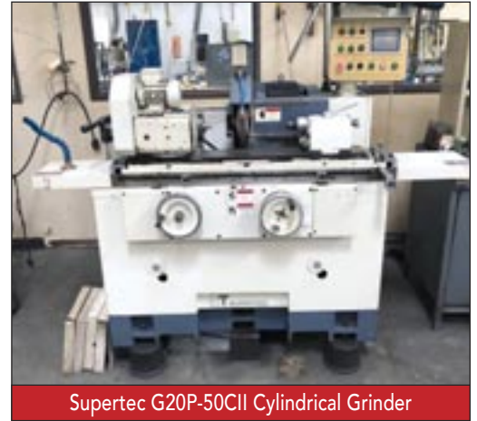
Supertec G20P-50CII Cylindrical Grinder