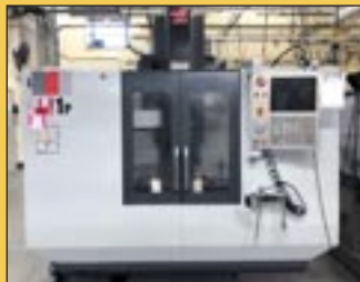
Haas TM-1P VMC