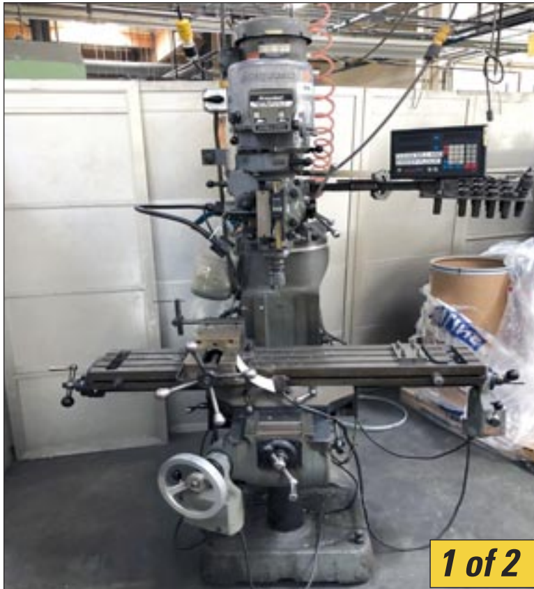
Bridgeport Vertical Mill