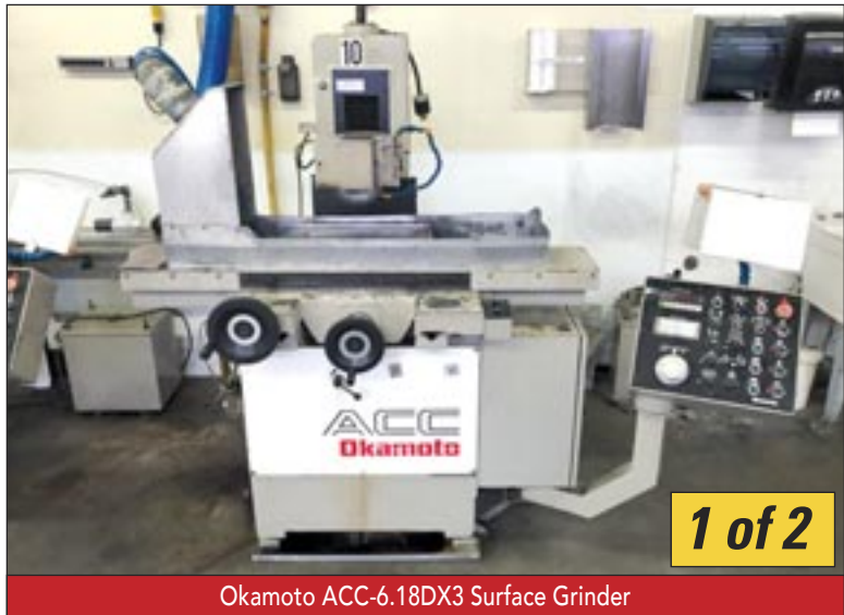
Okamoto ACC-6.18DX3 Surface Grinder