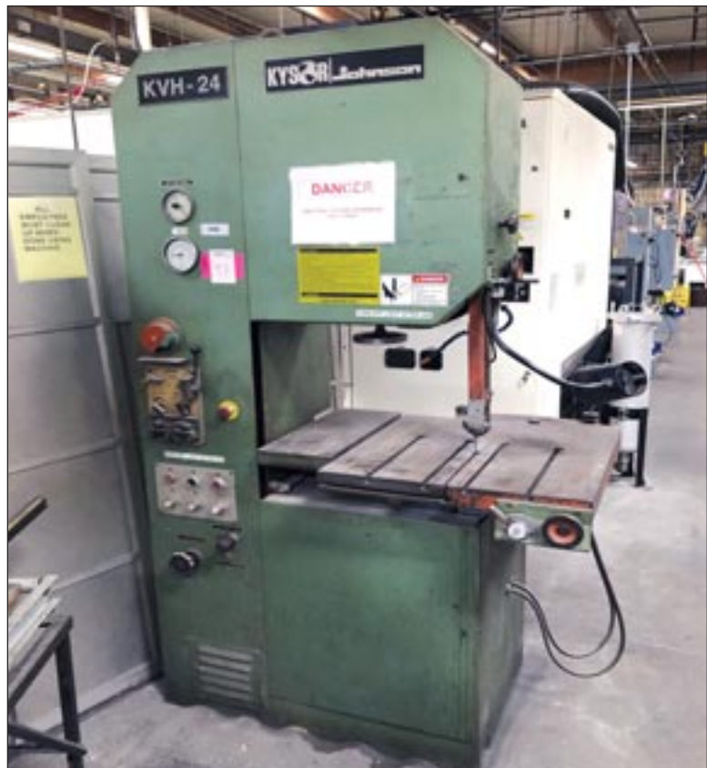
Kysor Johnson 24" Vertical Band Saw