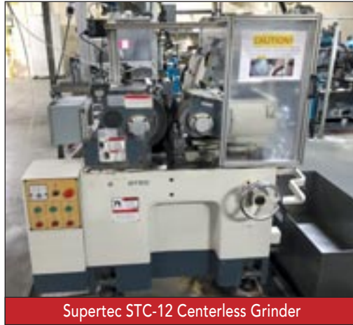
Supertec STC-12 Centerless Grinder