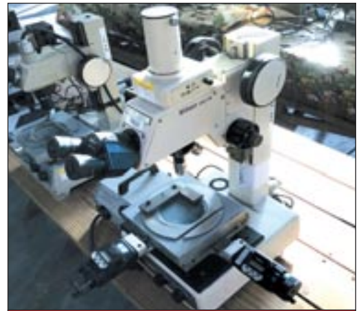
Nikon MM-11B Measurescope