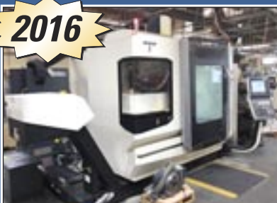
DMG Mori EcoMill 1100V VMC