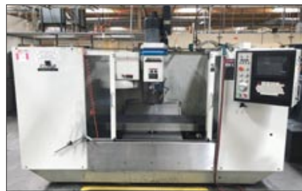
Fadal VMC4020 Vertical Machining Center