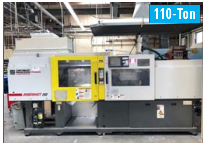
Cincinnati Milacron Roboshot 110 Plastic Injection Molder