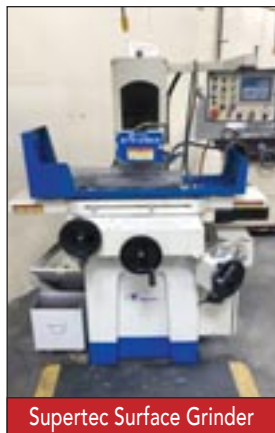
Supertec Surface Grinder