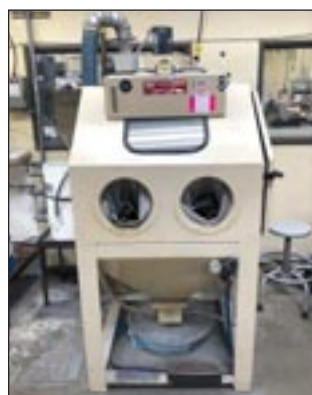
MBA Blast Cabinet