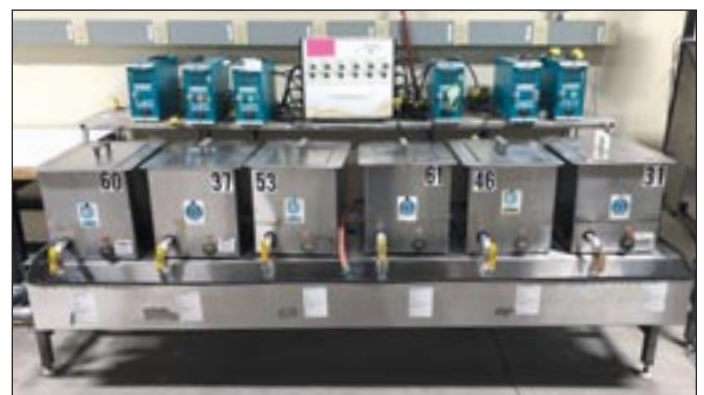
Crest Ultrasonic Cleaners