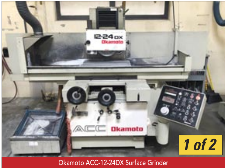
Okamoto ACC-12-24DX Surface Grinder