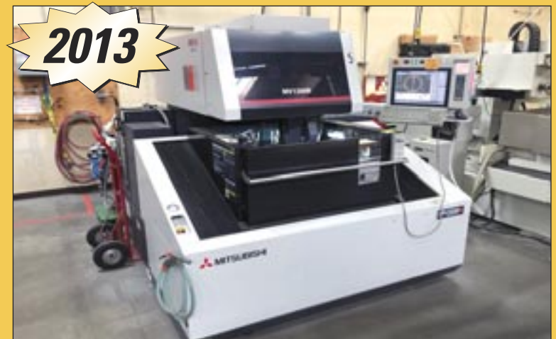
Mitsubishi MV1200R CNC Wire EDM