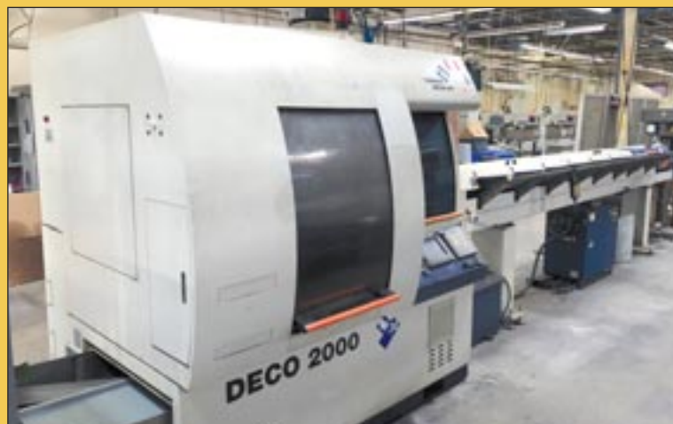
Tornos Deco 2000/20 CNC Swiss Lathe