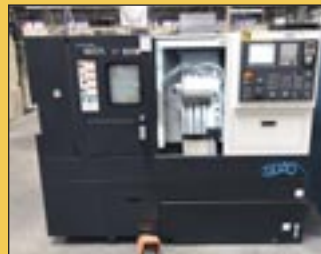
Hyundai Wia CNC Turning Center