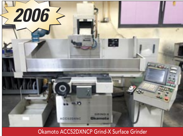
Okamoto ACC52DXNCP Grind-X Surface Grinder