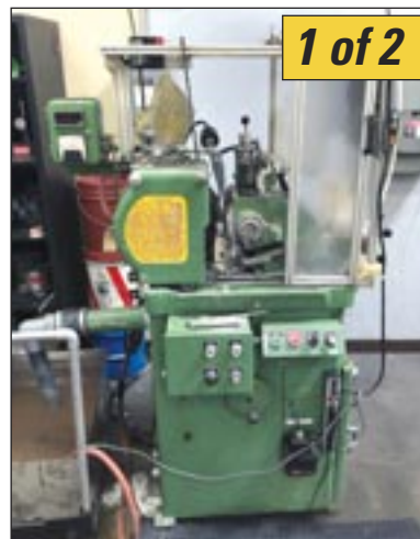
Royal Master Centerless Grinder