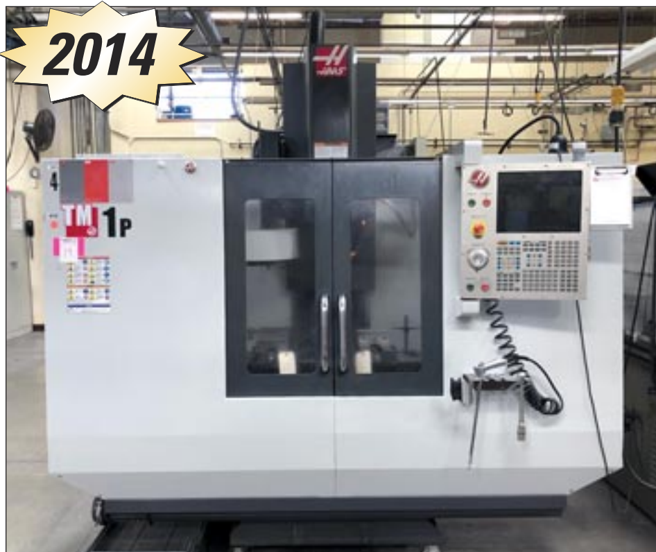
Haas TM-1P Vertical Machining Center