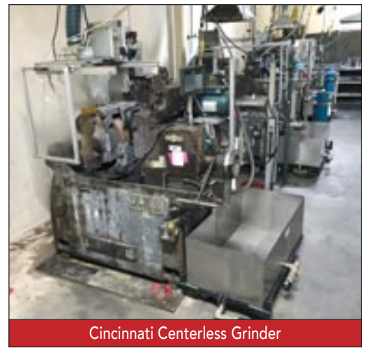
Cincinnati Centerless Grinder