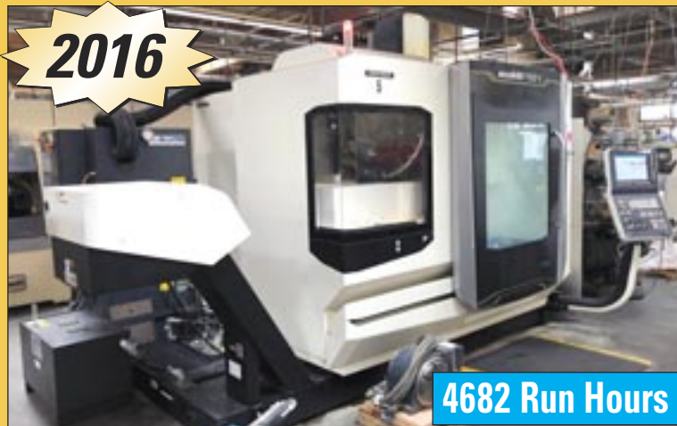
DMG Mori EcoMill 1100V Vertical Machining Center

FEATURING: CNC VMC's, CNC Turning Centers, CNC Wire EDM's, Surface Grinders Centerless Grinders, Cylindrical Grinders, Plastic Injection Molder, Toolroom, Finishing & Inspection Equip., Facility & Support