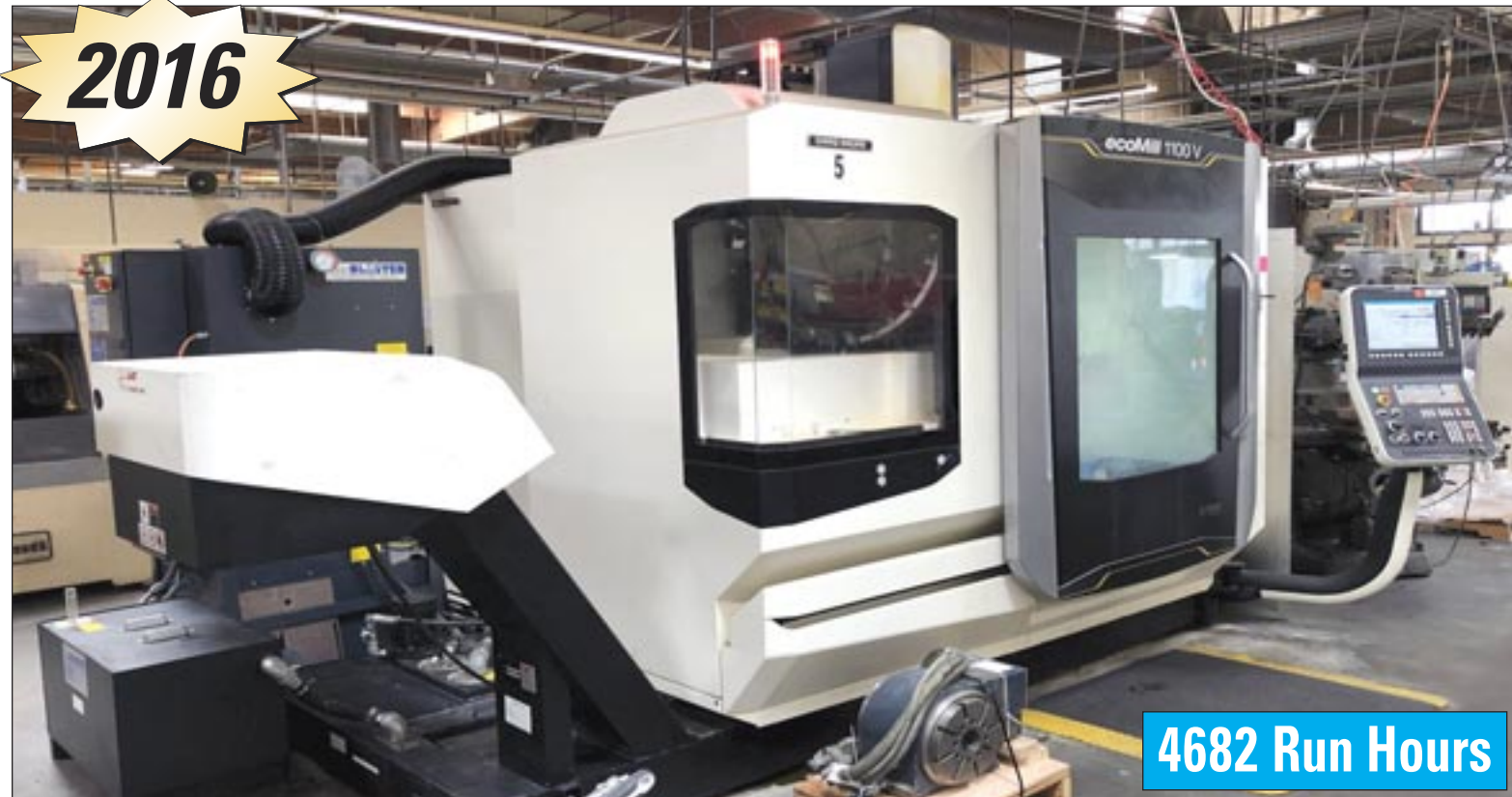
DMG Mori EcoMill 1100V Vertical Machining Center