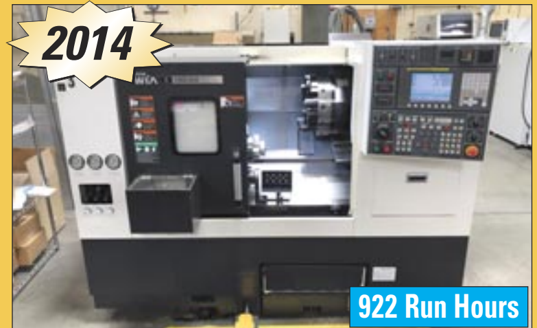
Hyundai Wia E160LMA CNC Turning Center