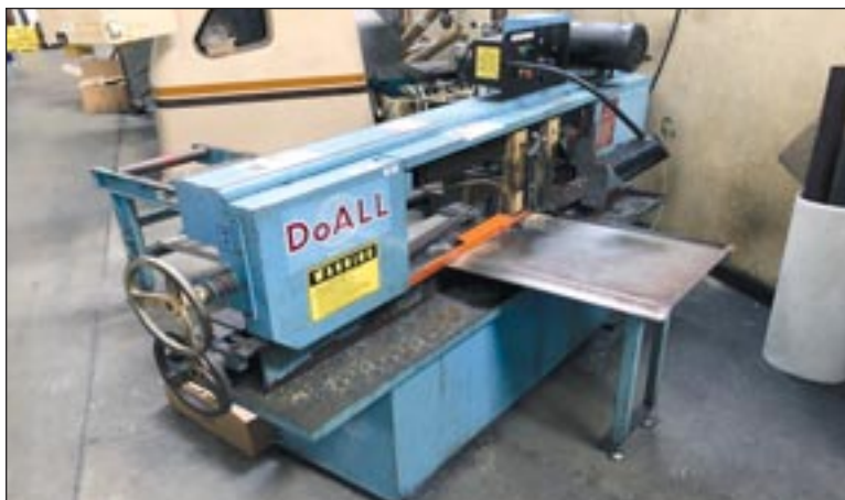
All C-916M Horizontal Band Saw