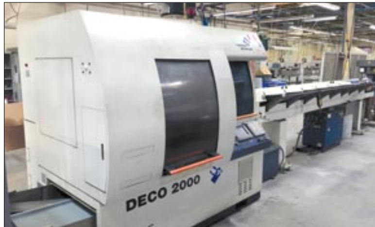
Tornos Deco 2000/20 CNC Swiss Lathe

• 1998 TORNOS DECO 2000/20 CNC SWISS LATHE , 20mm (.78") Bar Cap., Tornos-Bechler Fanuc PNC Deco Control, Read: 13,594 Hours, Royal Filtermist, Tornos Robobar SSF Bar Feeder – Equipto 12-Drawer Cabinet, w/Deco 2000 Tooling/Contents