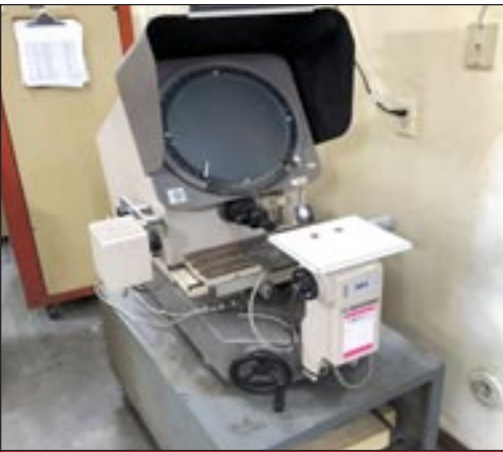
Mitutoyo PH-350 Optical Comparator