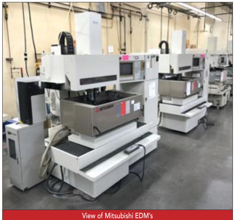
View of Mitsubishi EDM's

• 2013 MITSUBISHI MV1200R CNC WIRE EDM , X=15.7" Y=11.8" Z=8.7", Max. Workpiece Dimensions: 31.9" W x 27.6" D x 8.5" H, Advance Plus Control, Mitsubishi Unit Cooler • 2014 SMALTEC EM203 MULTI-PROCESS MICRO MACHINE , X=7.87", Y=7.87", Z=3.93", High-Speed Spindle, Mandrel Rotation: 0-6000 RPM, Nikon Stereo Scope, XGA 24-Bit True Color Digital Camera • (2) 1995 MITSUBISHI SX20 CNC WIRE EDMs , Mitsubishi Unit Cooler, Transformer • 1992 & 1993 MITSUBISHI DWC110SZ CNC WIRE EDM , Mitsubishi Unit Cooler, Transformer • 1998 & 1999 SODICK A325 CNC WIRE EDM , Mark 25 Control • (2) ELTEE PULSITRON TRM-21 EDMs • LARGE QUANTITY OF AGIE AGIETRON EDMs