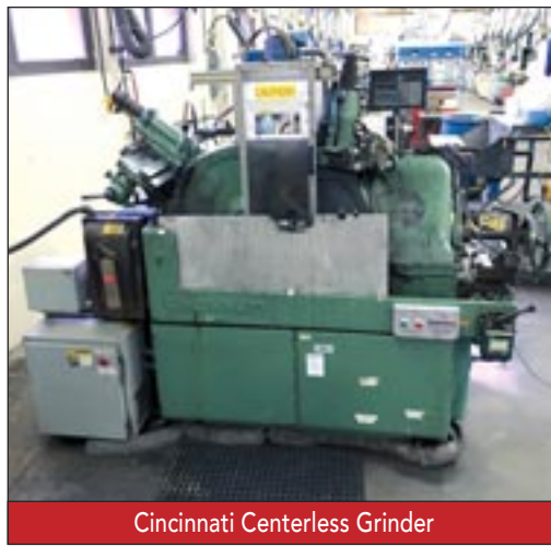
Cincinnati Centerless Grinder