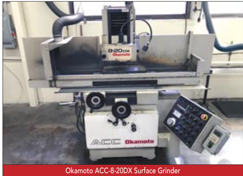
Okamoto ACC-8-20DX Surface Grinder