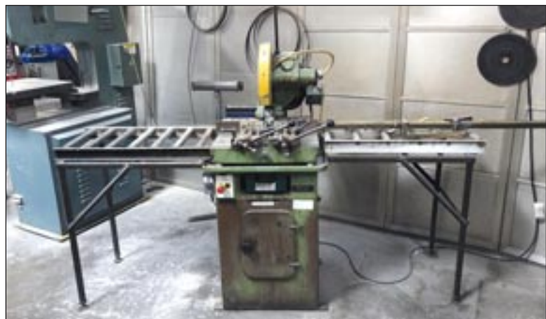
Haberle H350 Cold Saw