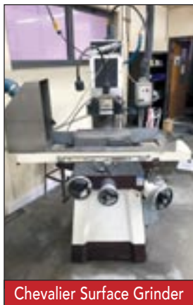
Chevalier Surface Grinder