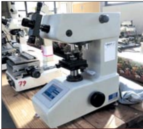
Leco LM-100 Microindentation Hardness Tester