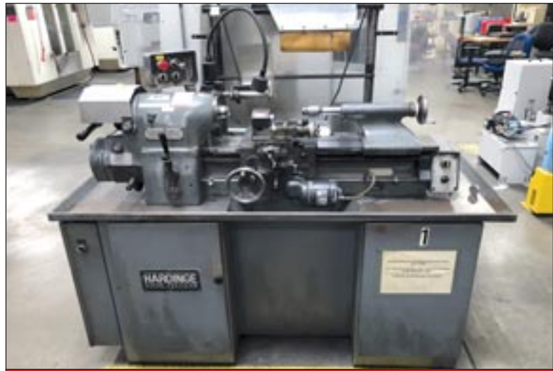
Hardinge HLV-H Super Precision Lathe