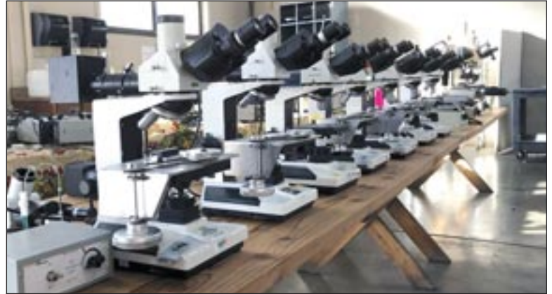
View of Microscopes