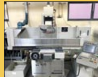
Okamoto Surface Grinder