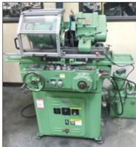
Myford MG12 Cylindrical Grinder