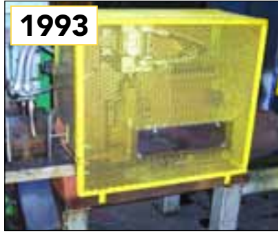
1993 FASTENER ENGINEERS, WIRE STRAIGHTENER CUT-OFF