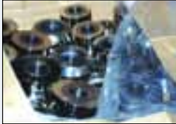
YODER TUBE MILL TOOLING