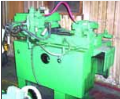
12" X 12" X .270" AIRFEEDS INC., MDL. AF-4