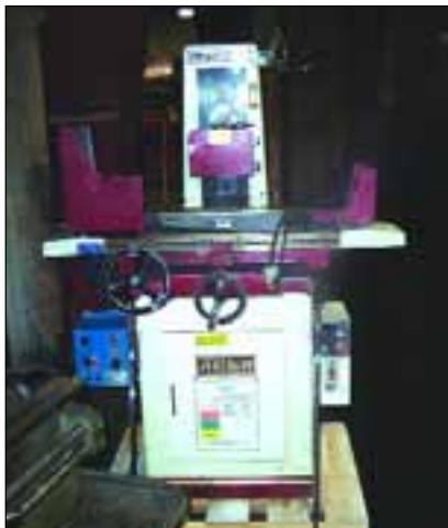
ACER SURFACE GRINDER, SUPRA-618