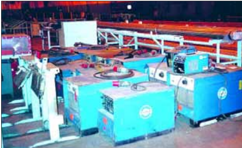
VIEW OF MILLER POWERSOURCES