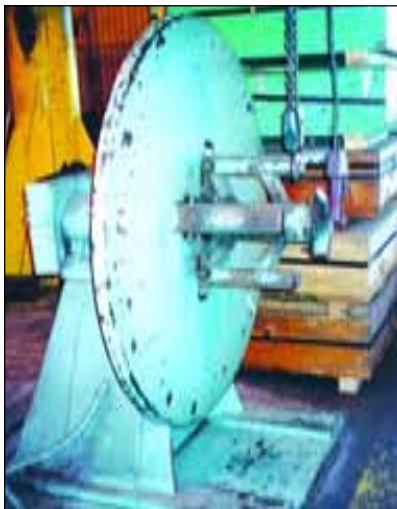
4000# LITTELL REEL