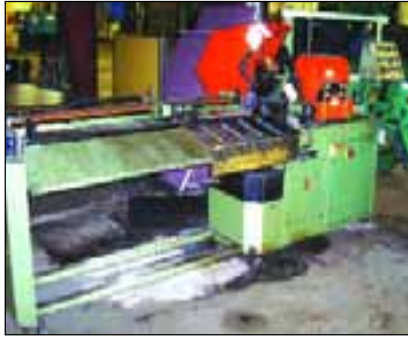
SCOTCHMAN COLD CUT-OFF SAW, MDL. 315LT/RFA