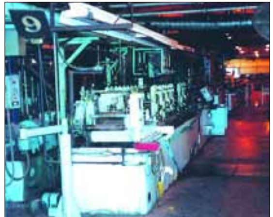
3" MCKAY, MDL. RS 625

TO SCHEDULE AN APPRAISAL, CALL 818.508.7034