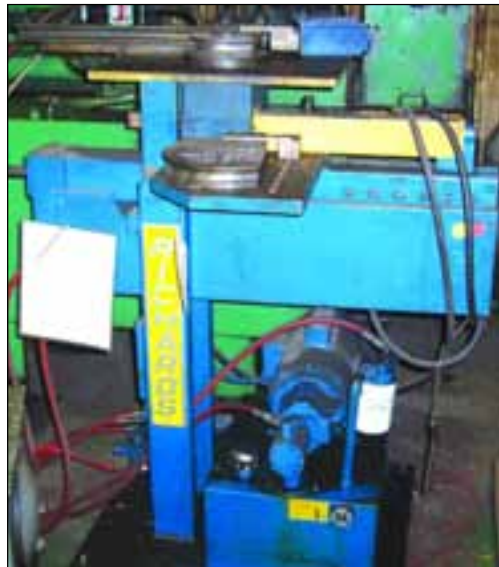
RICHARDS MULTIFORM HYDRAULIC TUBE BENDER