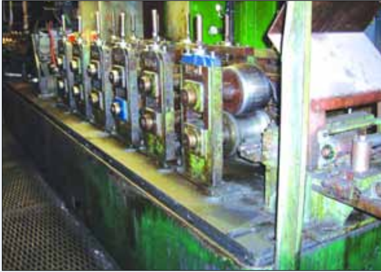
3" X .134" YODER TUBE MILL, MDL. M2 1/2