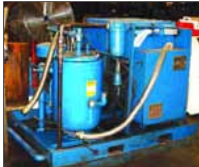
LEROI 50 HP, AIR COMPRESSOR