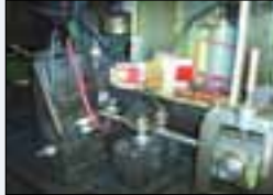
YODER TUBE MILL WELD AREA