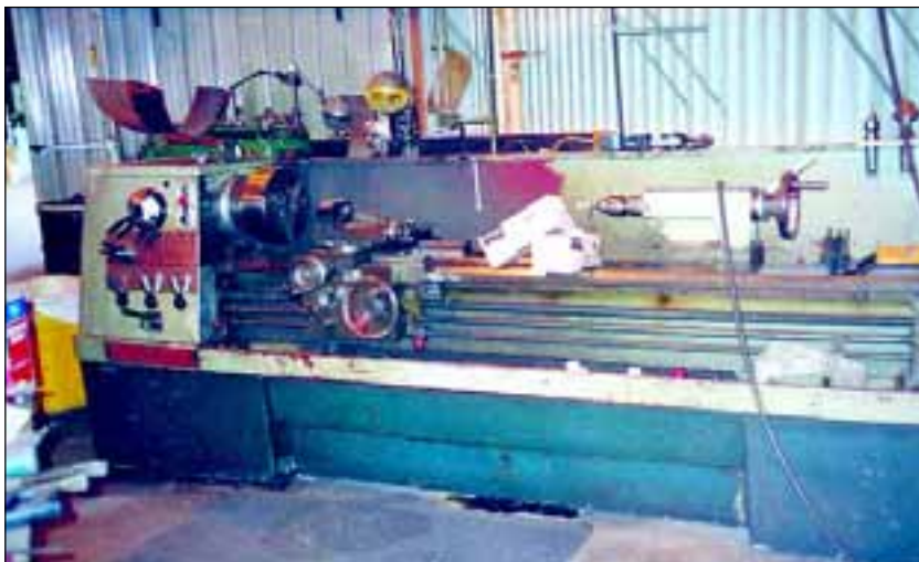
17" CLAUSING COLCHESTER GEARED HEAD ENGINE LATHE