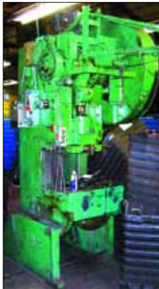
60-TON BLISS OBI PRESS, MDL. C-60