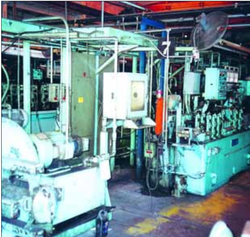
1-1/2" ABBEY ETNA TUBE MILL LINE, MDL. 1KU