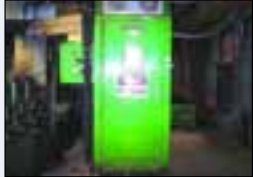
THERMATOOL VT-160HF WELDER