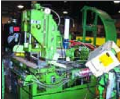
30-TON NEWBERRY VERTICAL INJECTION MOLD MACHINE