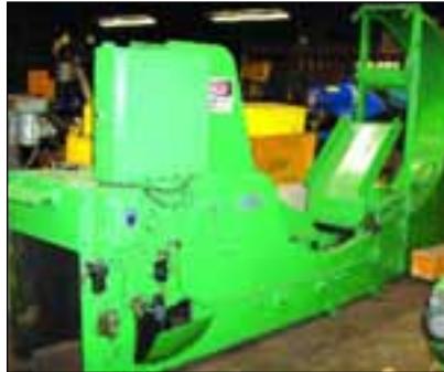
10,000# COILMATIC COIL CRADLE, MDL. CC-1260-PS