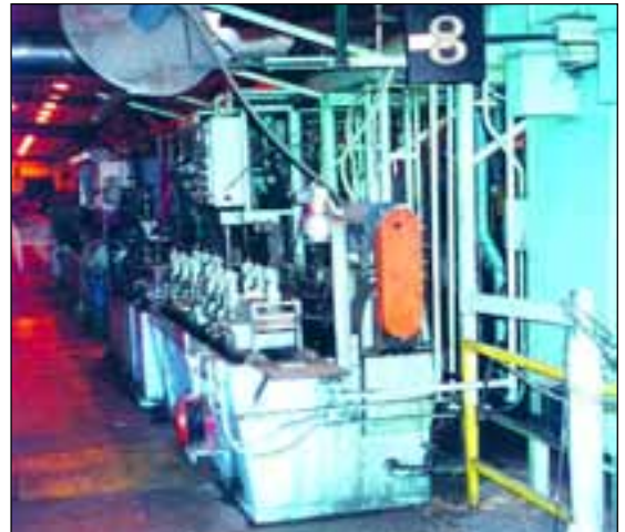
1-1/2" ABBEY-ETNA TUBE MILL, MDL. 1KU, S/N 360