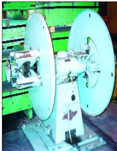
4000# LITTELL DOUBLE END REEL