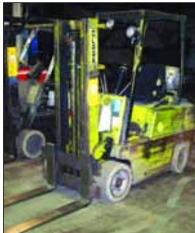
5,000# CLARK LP GAS FORK LIFT